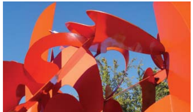
Artistic & Historic Wonders