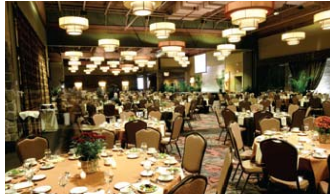
Variety of Meeting and Lodging