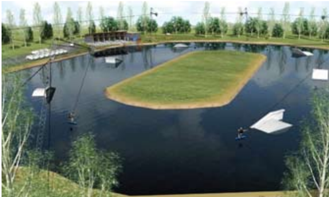
Innovative Mega Attractions

We cordially invite you to come see what's new(s) in Butler County, Ohio.